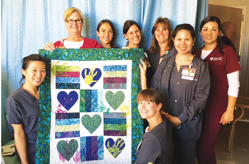
E1 Quilting Project members show an example of their work before it is given to a patient.

loving care their father received, and also for their final memories spent as a family. Other quilts have been used as a celebration. A single mother who was hospitalized for several months from severe graft-versus-host disease missed her son's elementary school graduation. Knowing how difficult this was for the patient to miss the graduation and understanding that her chances of survival were slim, the nurses threw a surprise graduation party for the mother and her son. While the patient was off the unit for a test, the patient's room was decorated with streamers, balloons, and a graduation sign. The party included cake, party favors and even a guitarist who played uplifting music from the nurses' station. The surprise for the patient, her son, and family led to a wonderful day of normalcy that patients seem to lose when they enter the hospital. As a gift from the nursing staff, a quilt was imprinted with hands from the family. The quilt hung on the wall in the patient's room for almost a month before she passed, serving as a constant reminder of good times and as encouragement for her to continue fighting.