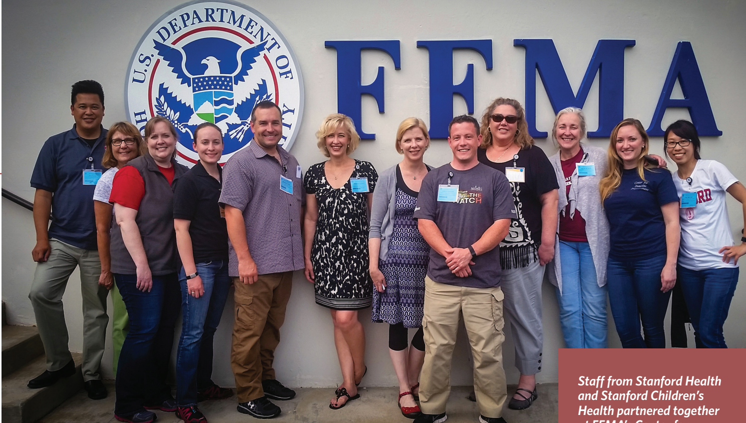
Staff from Stanford Health and Stanford Children's Health partnered together at FEMA's Center for Domestic Preparedness in Anniston, Alabama for immersive disaster management training.

even actors who represented anthrax and ricin exposed patients. The CDP's full scale facility enabled real life simulations of an emergency department surge and the activation of a hospital's command center during a mass casualty response. The Stanford team members were also trained on mass disasters which included structural collapse and foodborne illness. The team practiced providing care for events centered on biological agent release, chemical warfare release, explosions, and multiple motor vehicle accidents.